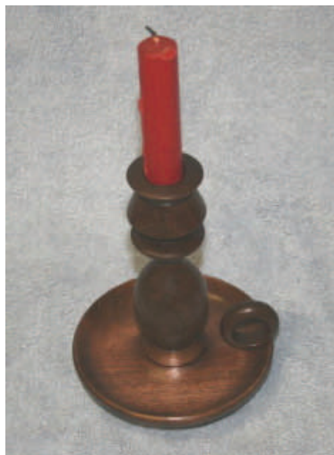
Guy Gerrard - Candlestick holder made from walnut and finished with tung oil.