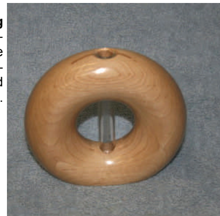
Ron Browning - Flower vase made from maple. Finished with deft.