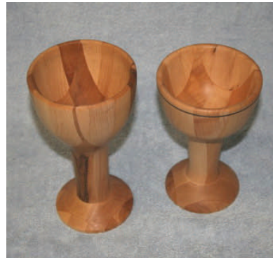
Pete Elden - Goblets made from maple and finished with Presurve. Goblets were turned from bowling pins.