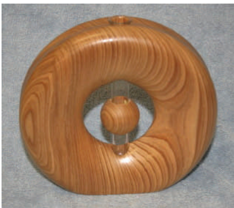
Ron Browning - Flower vase made from cypress. Finished with deft.