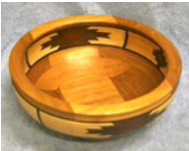
16) George Olio Segmented Southwest bowl made from cherry, black walnut and maple. Finished with lacquer.