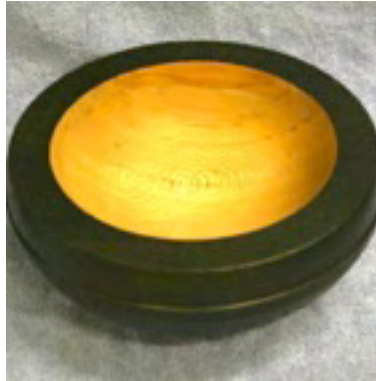
2) Gene gross Bowl made from sycamore. Finished with black patinatine was and lacquer. Textured with Sir Lancelot