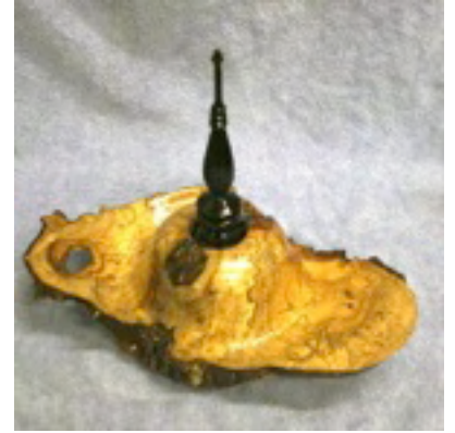
6) Tom Roach A free-form made from spalted maple. Finished with lacquer. Piece was 'very pithy.'