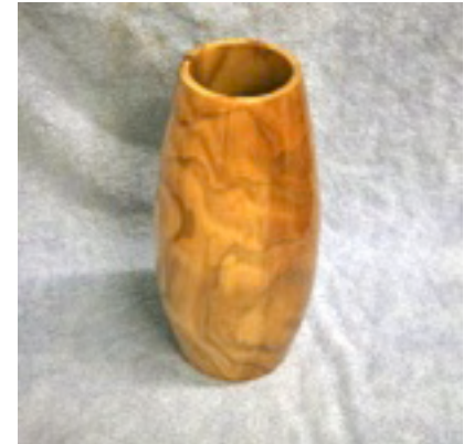
9) Tom Roach A vase turned from chinaberry. Finished with lacquer.