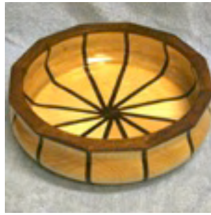
17) George Olio Segmented flat bowl made from cherry, black walnut and maple. Finished with lacquer.