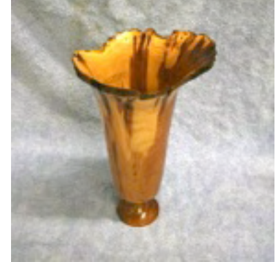
3) Gene Gross Natural-edge vase made from Drake elm.