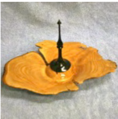
4) Danny Hoffman Flat-form tray with spindle. Tray is made from citrus root. Finished with lacquer and poly.