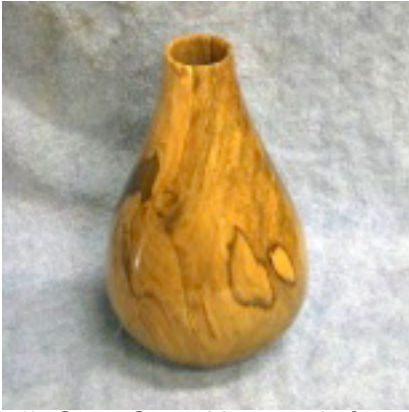
1) Gene Gross Vase made from 'curb wood;' probably soft maple. Finished with Minwax Poly.