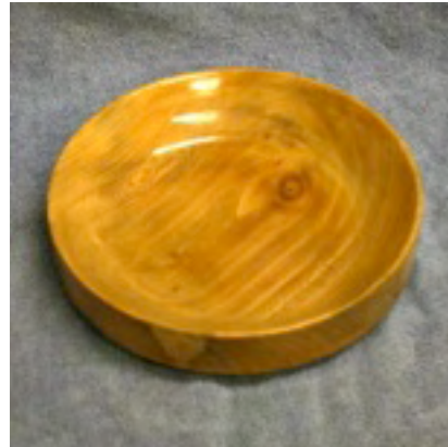
8) Tom Roach A shallow form made from sycamore. Finished with lacquer.