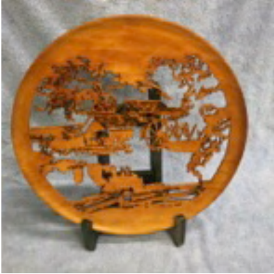
Tom Road Plater made from mahogany. Pattern was cut with a scroll saw. Finish is polycrylic.