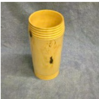
7) Tom Roach A vase cut from citrus. Finished with lacquer.