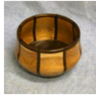
18) George Olio Segmented small bowl made from cherry, black walnut and maple. Finished with lacquer.