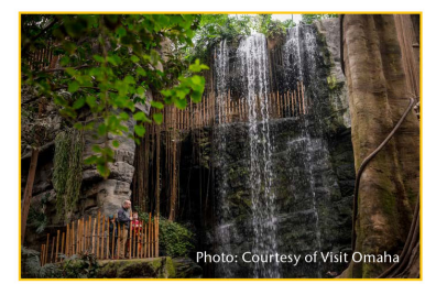
Henry Doorly Zoo and Aquarium

AAW leadership is moving forward with its plans for an in-person 2021 AAW Symposium in Omaha, despite the uncertainties surrounding the COVID-19 pandemic. Leadership is approaching arrangements for a live event cautiously, while monitoring pandemic developments, and will consider contingency plans as needed. AAW membership will be kept informed of developments and changes.