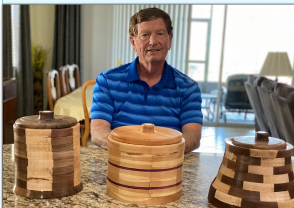
3 segmented bowls for the Beads of Courage program