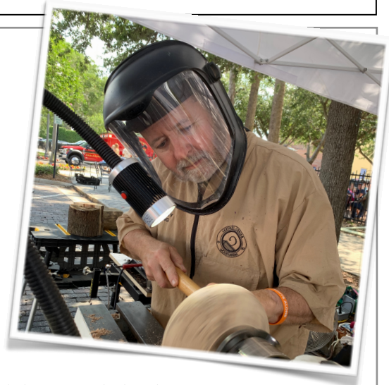
The City of