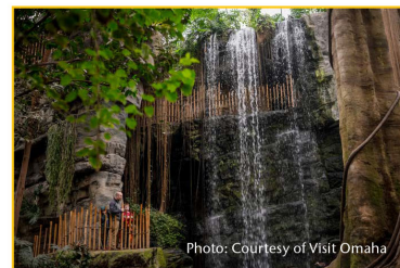
Henry Doorly Zoo and Aquarium

AAW leadership is moving forward with its plans for an in-person 2021 AAW Symposium in Omaha, despite the uncertainties surrounding the COVID-19 pandemic. Leadership is approaching arrangements for a live event cautiously, while monitoring pandemic developments, and will consider contingency plans as needed. AAW membership will be kept informed of developments and changes.