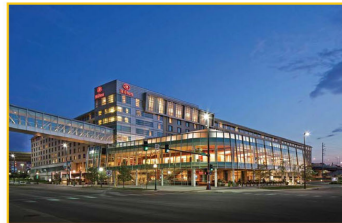
Hilton Omaha 1001 Cass St., Omaha, NE 68102