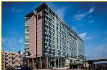
Omaha Marriott Downtown at the Capitol District 222 N 10th St., Omaha, NE 68102