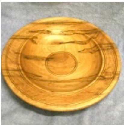
Jim Schroeen Platter Made from ambrosia maple and finished with Tung oil