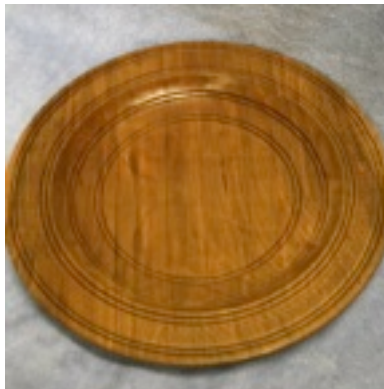
Jim Schroeen Platter Made from ambrosia maple and finished with Tung oil