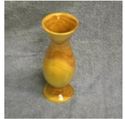
Tom Roach - Vase Turned from ironwood and finished with lacquer