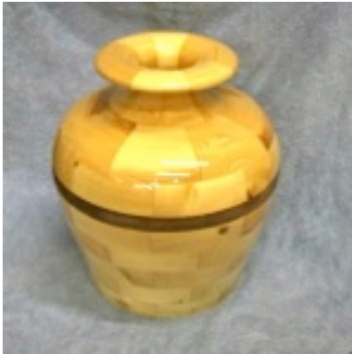
David McCoy Segmented Vase Composed of segments of spruce and mahogany and finished with polyurethane