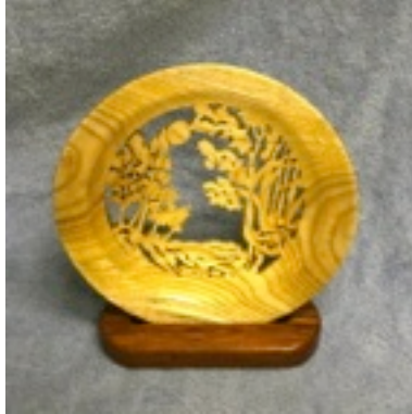
Tom Roach - Plater - with scroll work Made from sumac and finished with lacquer