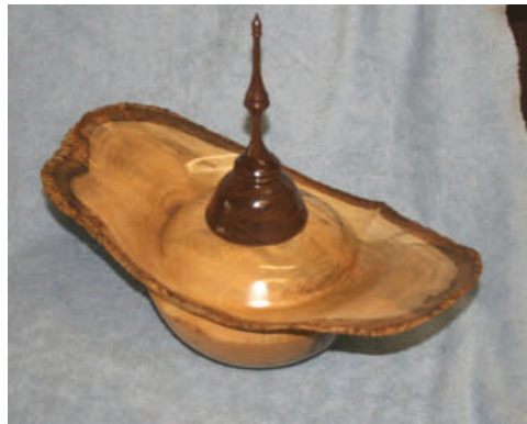
Bill Smith - Winged-hollow vessel turned from bay and walnut. Finished with lacquer