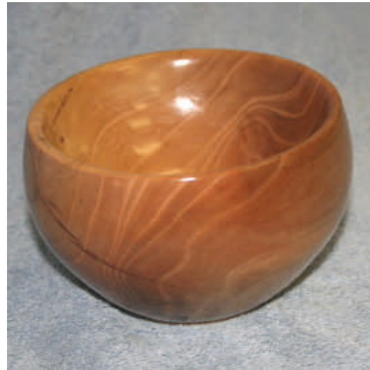
David Farrell - Bowl turned from bottle brush. Finished with 12 coats of water based poly ure- thane and lacquer spray