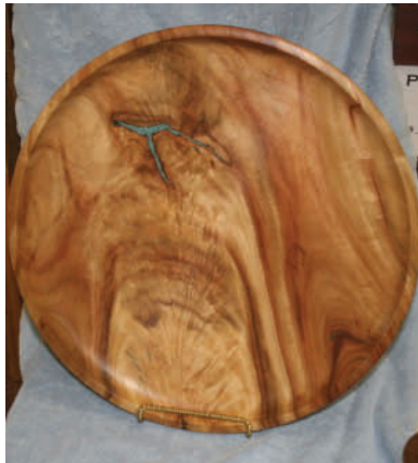
Bob Walker - Platter cut from camphor. Finished with lacquer