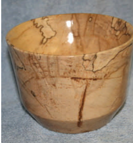
David Farrell - Bowl turned from spalted red maple, Finished with 12 coats of water based poly urethane and lacquer spray