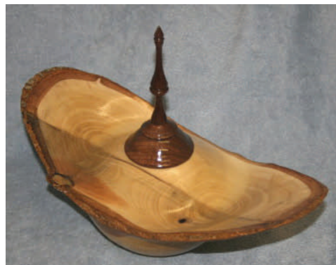
Bill Smith - Winged hollow vessel turned from bay and walnut. It is finished with wipe-on poly