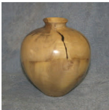
Gene Gross - Hollow form made from citrus root. Finished with deft