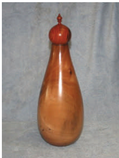
Gene Gross - Vase made from drake elm. Finial made from kingwood. Finished with deft