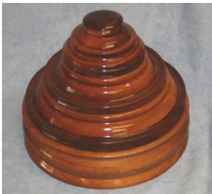
Victor Peters - Five-chamber box made from ma- hogany. Finished with boiled linseed and fast-dry enamel