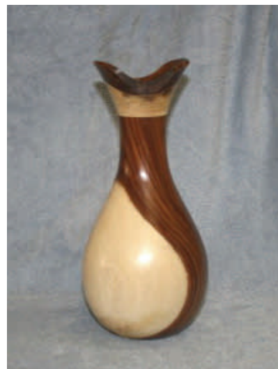
Gene Gross - Vase made from Florida rosewood. Finished with deft