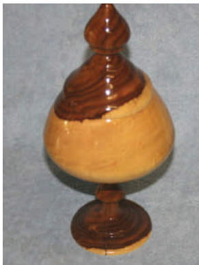
Bill Smith - Candy dish turned from rose wood. Finished with lacquer