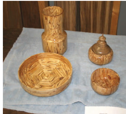
Tom Roach - Vase, bowl, small compote, and small bowl, all made from strand board. All are finished with lacquer and poly-urethane. This composite material is hard to turn because of the many voids.