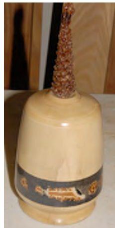
Citrus with Pine cone inlays with 5 min epoxy Laquer finish by Jim Pinckney