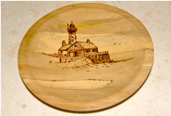
Platter with wood burning by done by Bill Dalton