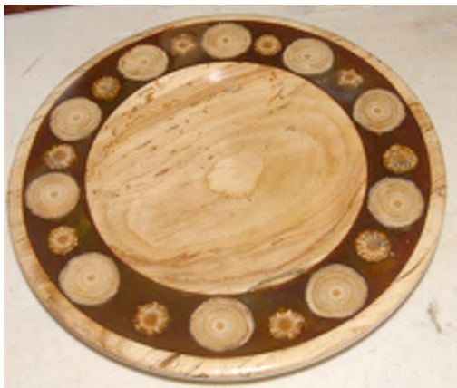
Platter by Jim Pinckney Pecan with Norfolk Pine medallions with epoxy inlay