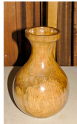
Last minute entry, unknown artist(woodturner)