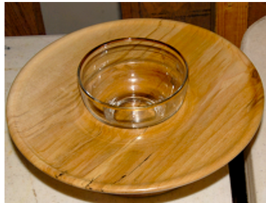
Work done by Tad Simmon - Maple with Mylands Finish