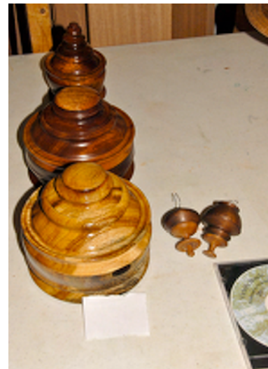
Box in a Box by Victor Peters with video