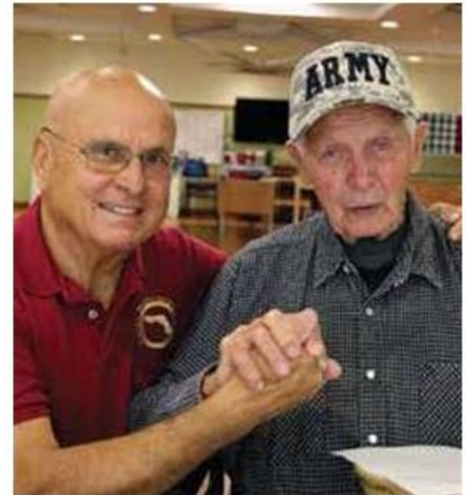
A CFW member and Warrior after he received his bowl and letter of appreciation.