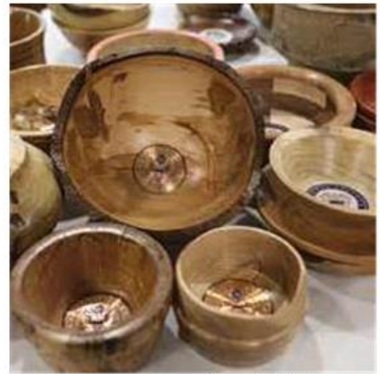
Some of the 127 bowls with embedded military branch medallions that were handed out by CFW members.