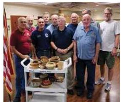
CFW members, glad for the opportunity to show their appreciation for our Wounded Warriors.